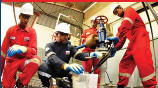
KSPT Training Process Simulator

The Kenson School of Production Technology (KSPT) , since its inception, the school has been the premier training institute for offshore platform experiences.