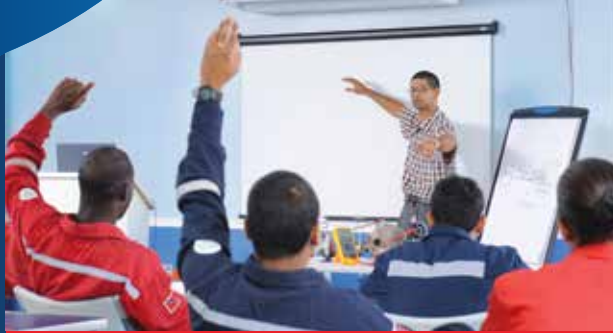
KSPT Training Facility